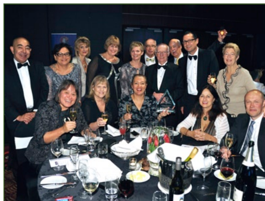
Fulbright New Zealand's supporters celebrate the award win

"There is a wonderful multiplier effect in the goodwill and understanding generated by our exchanges. Many grantees are accompanied by partners or whole families on their award. Each of those individuals touches the lives of so many people they meet during their exchange, and returns home to help spread a deeper understanding of their host country. Our alumni live the Fulbright mission of promoting mutual understanding for the rest of their lives." ➤