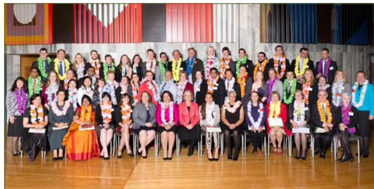
Fulbright grantees and dignitaries at the 2014 Fulbright New Zealand awards ceremony at parliament in June

For a full list of grantees currently on Fulbright exchanges in New Zealand and the US, please visit www.fulbright.org.nz/grantees-alumni/grantees