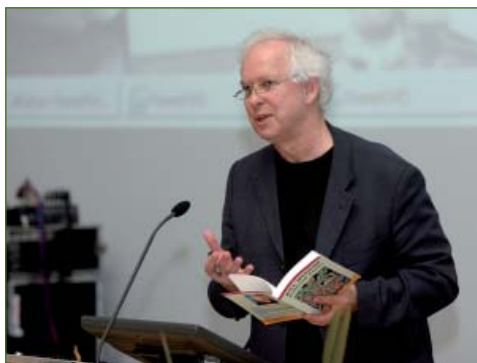
Fulbright alumnus Bill Manhire reads poetry written during his Fulbright exchange to the US