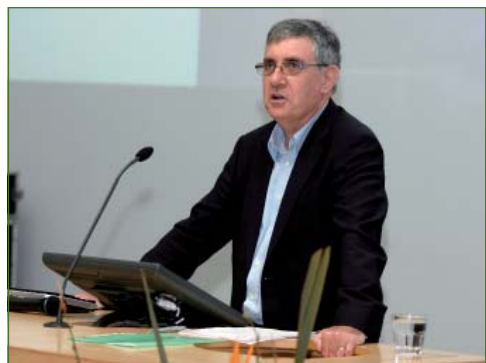
New Zealand keynote speaker Professor Paul Callaghan discusses the life of Nobel Prize-winning Fulbright alumnus Alan MacDiarmid and other NZ-US exchanges in the field of science