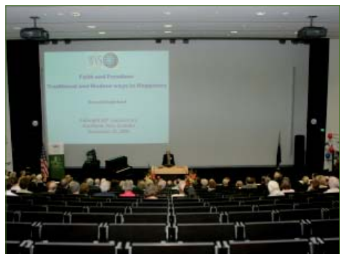
US keynote speaker Professor Ronald Inglehart addresses the Fulbright New Zealand 60th Anniversary Symposium in the University of Auckland Business School's Fisher & Paykel Appliances Auditorium