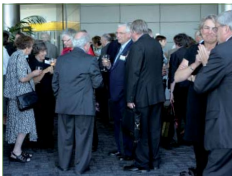
Fulbright alumni and supporters mingle at the evening reception