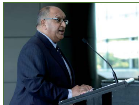
Governor-General of New Zealand Hon Anand Satyanand congratulates Fulbright New Zealand on its 60th Anniversary