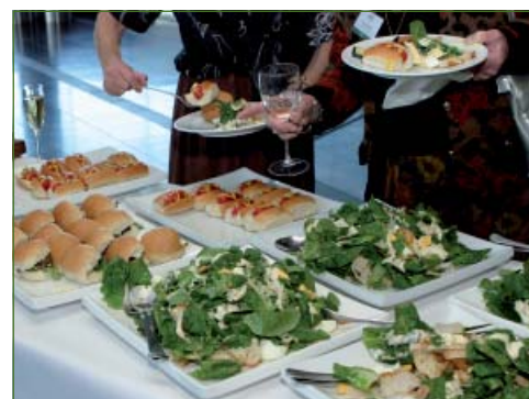
Guests enjoy American food from one of several themed menus