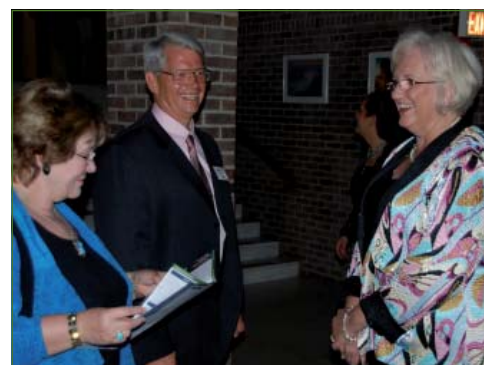
Guests mingle at the gala dinner