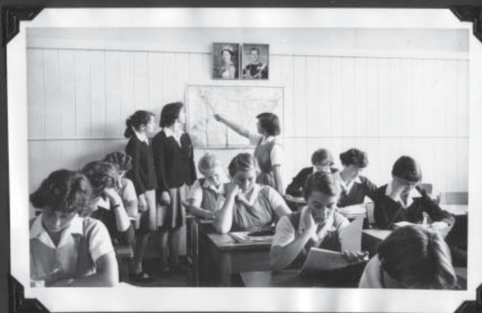
FORM 4A - PNGHS - STUDYING THE USA

These photographs are just a small part of Dorothy's record of her fruitful exchange.