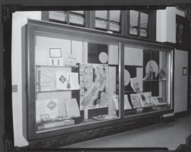
A WEST SEATTLE HIGH SCHOOL DISPLAY CASE, SHOWING THE MANY SCRAPBOOKS AND PROJECTS SENT TO THEM BY PALMERSTON NORTH GIRLS' HIGH —

I trust these records and pictures will speak for themselves. It has been a very, very busy year!