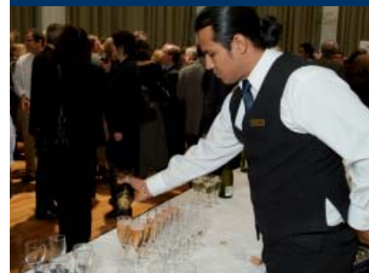
Champagne is served to celebrate Fulbright New Zealand's 60th Anniversary