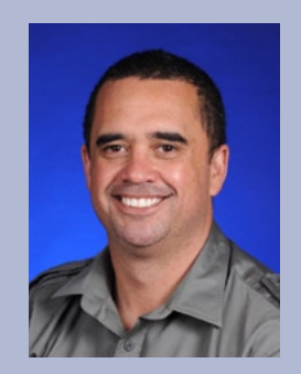
3 December 2014 Wellington