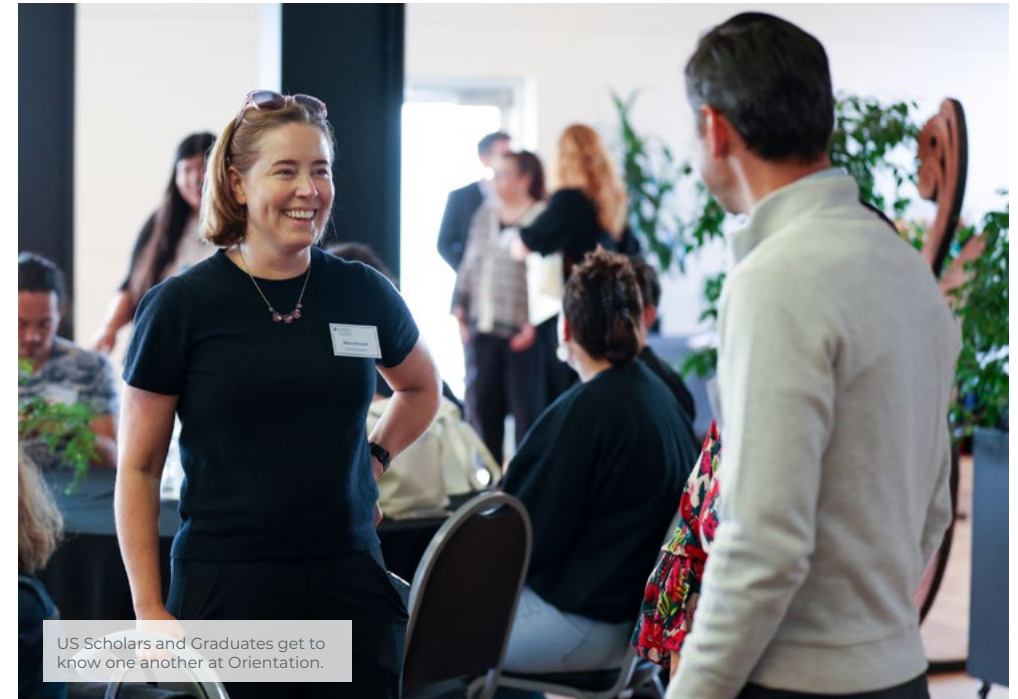
US Scholars and Graduates get to know one another at Orientation.