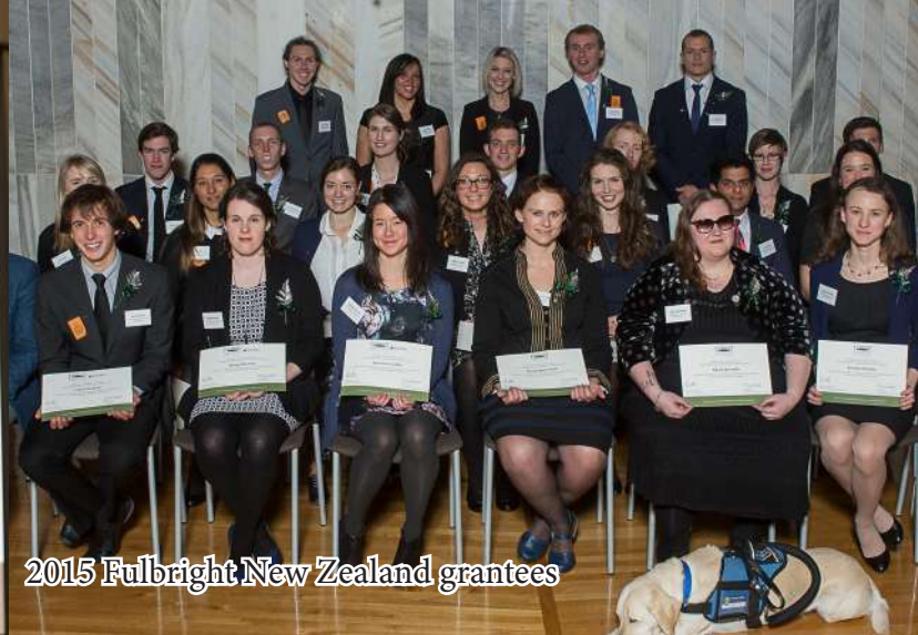
2015 Fulbright New Zealand grantees