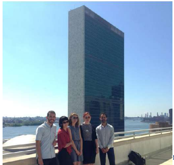
Right: This year's Fulbright-mtvU Fellows. This is an award for U.S. graduate students and recent graduates to pursue a project exploring the power of music as a global force for mutual understanding. The selection panel this year included Macklemore & Ryan Lewis, Fall Out Boy bassist Pete Wentz and the band OK Go.