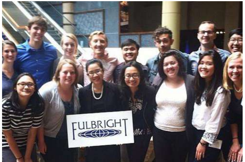
Right: A new cohort of U.S. Fulbright grantees getting ready to travel abroad.