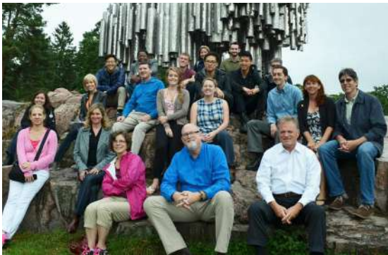
Above: Fulbrighters at their orientation in Finland.