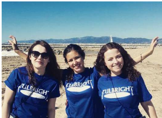
Below: Fulbright grantees from Ireland soak up some sun and explore the local scenery while on their exchange.