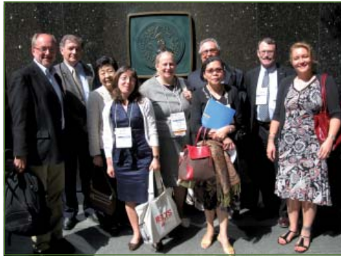
Fulbright Executive Directors from around the world meet in Los Angeles during the NAFSA 2009 Annual Conference in May