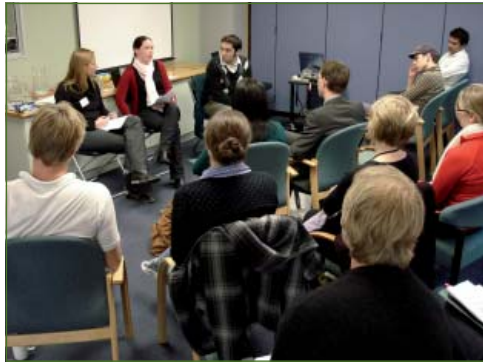
Past and present Fulbright grantees prepare soon-to-be-departing Fulbright New Zealand graduate students for life in the US, during their pre-departure orientation programme in June