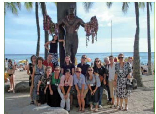
Fulbright-Hays Seminar Abroad participants gather for a pre-departure orientation in Hawai'i before their study tour of New Zealand and Mongolia